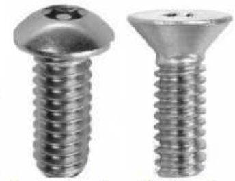
Button Head Flat Head